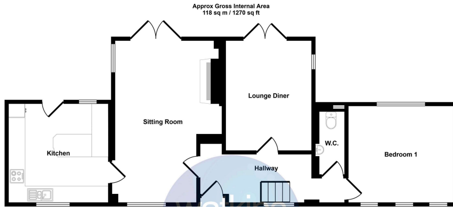
Ground Floor Approx 75 sq m / 806 sq ft

This floor plan is for illustrative purposes only and measurements of doors, windows, rooms and any other items are approximate. No responsibility is taken for any error, omission, or misstatement. The services, systems and appliances shown have not been tested and no guarantee as to their operability or efficiency can be given.