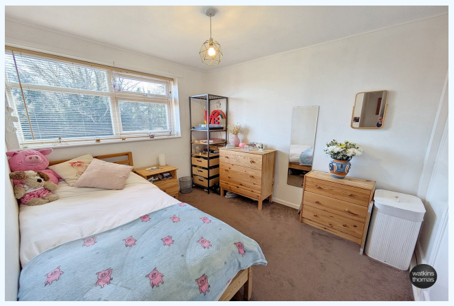
Bedroom 3 2.97m (9'9) x 1.88m (6'2) With front aspect double glazed window.