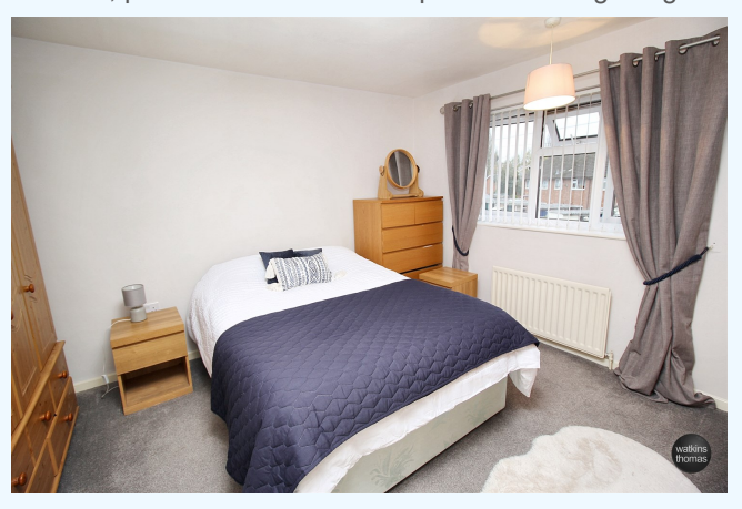
Bedroom 2 3m (9'10) x 2.87m (9'5) maximum (into door recess) With front aspect double glazed window, access hatch to loft space and panelled radiator.

With rear aspect double glazed window, panelled radiator and cupboard housing the gas central heating boiler.